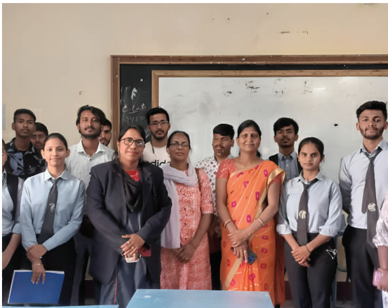
Glimpse from a Legal Awareness Programme conducted by DLSA, Jaipur (Rajasthan)

March 11, 2025: DLSA, Jaipur (Rajasthan), in collaboration with SSG Pareek College, Jaipur, organized an awareness campaign titled "Sensitization Programme on the Rights of Women, Scheduled Castes, Children, the Elderly, Persons with Disabilities, Poor Migrants, People Living with HIV/AIDS, and Transgender Persons." The primary objective of the campaign was to spread awareness about the rights and legal provisions available to these vulnerable groups and to promote inclusivity and legal empowerment through education. The session highlighted the importance of legal safeguards and support systems for marginalized communities. The event saw enthusiastic participation from 35 students, who actively engaged in meaningful discussions and gained valuable insights into the legal protections and resources available to these groups. The campaign aimed to cultivate a sense of social responsibility and encourage the students to become advocates for the rights and welfare of these vulnerable populations.