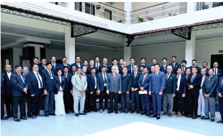
Glimpse from Refresher Training Programme conducted at Chhattisgarh State Judicial Academy

March 23, 2025: A One-Day Refresher Training Programme was organized for Legal Aid Defense Counsels at the Chhattisgarh State Judicial Academy. The training aimed to strengthen the legal knowledge, courtroom skills, and procedural understanding of Legal Aid Defense Counsels to ensure effective representation of beneficiaries with professionalism, empathy & a strong commitment to justice under the legal aid system. The programme included expert-led sessions, interactive discussions, and practical insights on recent developments in criminal law and defense strategies. Participants also had the opportunity to engage in case studies to apply the knowledge gained in real-world scenarios. This initiative forms an integral part of the ongoing and concerted efforts to enhance the quality and efficiency of legal aid services across the state.