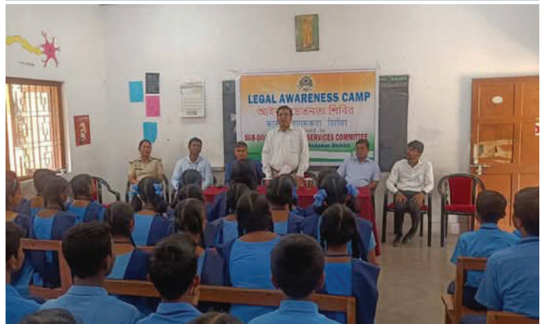
DLSA, Andaman & Nicobar Islands at VKV Zilla Parishad School, Basantipur

February 24, 2025: DLSA, Dibang Valley (Arunachal Pradesh), organized a one-day Free Legal Awareness Camp at the Government Residential School in Punli. The session aimed to enlighten students and staff about key legal safeguards for children, focusing on the Protection of Children from Sexual Offences (POCSO) Act, 2012, and the Prohibition of Child Marriage Act, 2006. The camp sought to enhance awareness and understanding of child protection laws, promoting legal literacy among young learners and empowering them with knowledge about their rights and protections under the law. It also encouraged open discussions about challenges faced by children in the community and highlighted the importance of reporting any form of abuse. The session was designed to ensure that the students and staff are equipped with the essential information and practical knowledge to protect themselves and those around them.