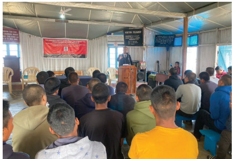
Glimpse from a Legal Awareness Programme at District Jail, Lunglei (Mizoram)

January 6, 2025: A legal awareness camp was organized by DLSA Nainital (Uttarakhand) at District Jail Nainital and Sub Jail Haldwani, where prisoners' concerns were addressed by the Hon'ble Chairman, DLSA. Inmates were informed about National Lok Adalat, compounding, remission, commutation, the e-Prison portal, e-true copy, and sensitization was done regarding various schemes and prisoner rights. It emphasized the importance of legal support and dignity for incarcerated individuals. The benefits of skill development were highlighted, with discussions focusing on how acquiring new skills can significantly contribute to the rehabilitation and reintegration of prisoners into society post-release. Jail PLVs were sensitized on the NALSA Prison Legal Aid Clinic SOP to ensure effective implementation of legal aid services inside prisons. A survey on caste-based discrimination in jail work allotment was also conducted.