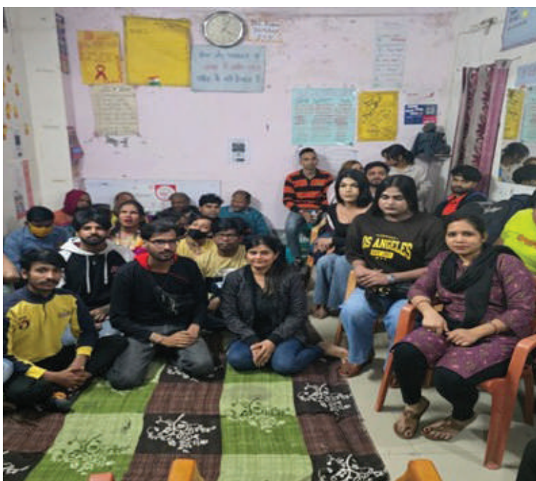
Glimpse from a Legal Awareness Programme conducted by DLSA, South-East (New Delhi)

March 5, 2025: DLSA, South-East (New Delhi), in collaboration with Bal Vikas Dhara NGO, organized an awareness session for transgender individuals and sex workers on the topic “ Legal Rights of Sex Workers & Fundamental Rights. ” The session witnessed the participation of approximately 40 individuals. The initiative aimed to raise awareness about the legal provisions and protections available to sex workers and transgender persons, including their fundamental rights and access to justice. The Participants were also informed about available support systems such as the NALSA Helpline (15100) and DSLSA Helpline (1516), both of which are operational 24x7. The session not only fostered open dialogue but also addressed individual concerns, and emphasized the importance of dignity, equality, and legal empowerment for marginalized communities. Through an interactive format, the initiative created a safe and inclusive space for participants to share their experiences and better understand their legal rights. It also reinforced the commitment of legal services institutions to extend meaningful support to those who are often on the fringes of the justice system.