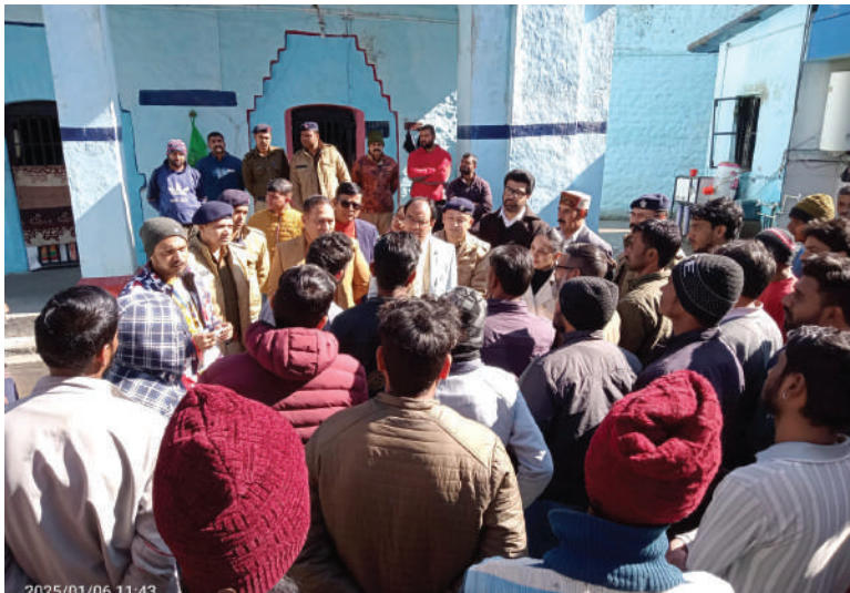
DLSA Nainital (Uttarakhand) at District Jail Nainital and Sub Jail Haldwani

February 13, 2025: A Special Campaign and Legal Awareness Programme was conducted at District Jail, Lunglei (Mizoram) in collaboration with the Healthy Lunglei Campaign. The initiative included a health screening drive to address the legal and medical needs of the inmates, ensuring their holistic well-being and access to justice. In addition to providing legal awareness on topics such as prisoner rights, legal aid, and available support schemes, the programme aimed to promote health and wellness among the inmates. The session offered a holistic approach to care, addressing both an individual's physical health concerns and legal entitlements, ensuring they are informed and empowered in seeking justice and support. This multifaceted and rehabilitative campaign underscored the critical and often overlooked link between legal empowerment and physical well-being within custodial settings.