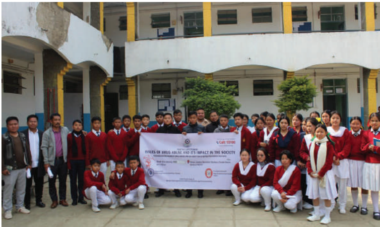
DLSA, Chandel (Manipur) at Jawahar Navodaya Vidyalaya (JNV)

January 30, 2025: DLSA, Dehradun (Uttarakhand), organized a legal awareness camp at Shri Guru Ram Rai Public School, Bindal, to educate students on important legal and social issues. The session covered the POCSO Act, Cybercrime, Social Media fraud, the ill effects of drug addiction, and introduced students to the NALSA toll-free legal aid helpline 15100. In addition to the awareness programme, a cleanliness rally was conducted by the students to mark National Cleanliness Day, promoting hygiene and social responsibility. The event witnessed enthusiastic participation and served as a meaningful initiative towards empowering youth through legal knowledge and civic awareness. Resource persons from the legal fraternity and police department engaged with the students, addressing their queries and encouraging proactive legal awareness. The session adopted a student-friendly approach, making complex legal topics more relatable for the young audience.