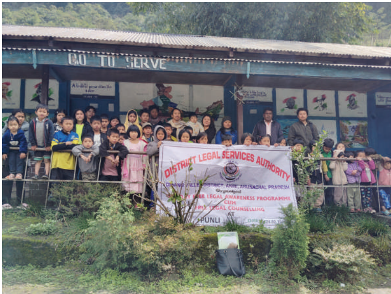
DLSA, Dibang Valley (Arunachal Pradesh) at Government Residential School, Punli

At Colleges & Schools : Empowering the Future Leaders through Knowledge