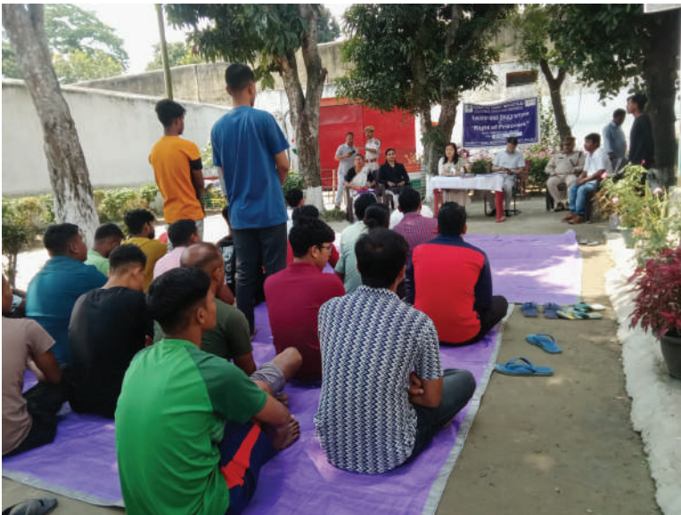
DLSA, Majuli (Assam) at District Jail, Majuli

March 26, 2025: DLSA, Majuli (Assam) organized an awareness programme at the District Jail, Majuli, focusing on key aspects of the Premature Release, Parole, and Furlough of Prisoners, along with the broader Rights of Prisoners. The programme was focused on generating consciousness amongst the inmates and prison authorities about legal safeguards and mechanisms available under the law to ensure humane and just treatment of incarcerated individuals. It provided valuable information on the procedures for applying for premature release, parole, and furlough, helping inmates understand their rights and avenues for seeking temporary release. The initiative also emphasized the importance of ensuring fair treatment for prisoners, promoting rehabilitation, and encouraging better access to legal remedies. By addressing these critical issues, the programme aimed to significantly enhance legal awareness among inmates and reinforce the principles of justice and human dignity within the prison system.