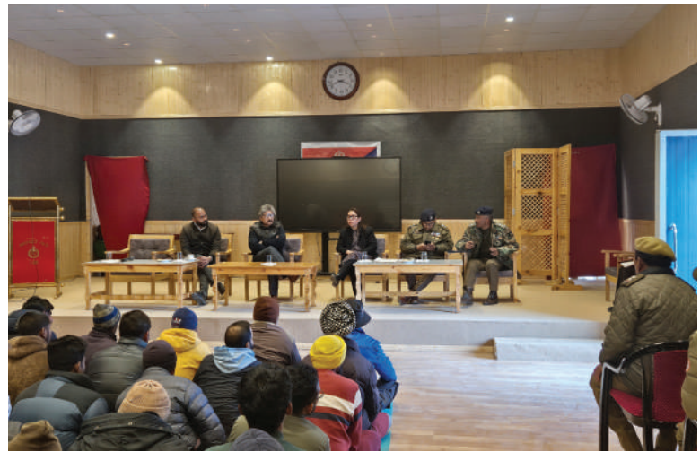
DLSA, Leh (Ladakh) at District Jail, Leh

March 27, 2025: DLSA, Leh (Ladakh) organized an awareness programme at the District Jail, Leh, focusing on the rights and entitlements of prisoners. As part of the initiative, the DLSA also conducted a screening to identify undertrial prisoners who were unrepresented, in order to extend free legal aid and ensure access to justice. This outreach programme aimed to create awareness among inmates about their legal rights while reinforcing the commitment of the DLSA to safeguard the rights of undertrial prisoners. Additionally, the programme highlighted the importance of legal representation in ensuring fair trial and preventing prolonged detention without proper legal recourse. The initiative emphasized the DLSA's role in promoting legal literacy and fostering a more inclusive justice.