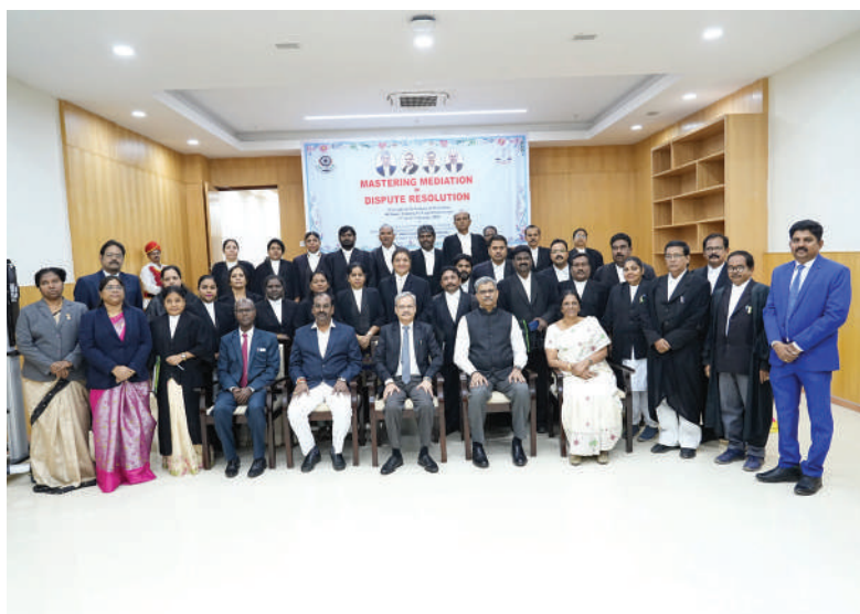
Glimpse from a Training Programme Organized by Andhra Pradesh SLSA

February 17, 2025: A 40-hour Mediation Training Programme was conducted at the premises of the Hon'ble High Court, organized by the Andhra Pradesh SLSA, Andhra Pradesh HCLSC, and the Mediation and Conciliation Project Committee (MCPC). The programme was inaugurated by Hon'ble Mr. Justice Ravi Nath Tilhari, who emphasized the importance of mediation in resolving disputes efficiently and reducing court caseloads. The Master Trainer provided participants with hands-on training in mediation techniques. The training aimed to enhance participants' mediation skills, enabling them to resolve disputes amicably and contribute to a more efficient justice system. The programme received an enthusiastic response from participants, reflecting a growing recognition of mediation as a vital tool in access to justice. Such initiatives are instrumental in building a cadre of trained mediators to support alternative dispute resolution mechanisms across the country.