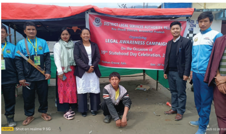
DLSA, Kra-Daadi (Arunachal Pradesh) at Nyokum Ground, Palin

January 28, 2025: DLSA, Ukhrul (Manipur), in collaboration with Tora Legal Aid Clinic, organized a Legal Awareness Programme at Champhung/Aphung village in Ukhrul District. The programme focused on three key topics: the menace of drug abuse, legal rights, and the availability of legal services. Advocates from Ukhrul District served as the Resource Person, delivering insightful guidance on these important issues. A total of 50 participants attended the session, which aimed to empower the local community with knowledge of their rights and available legal remedies while also addressing the growing concern of drug abuse. Resource persons engaged in interactive discussions with community members, encouraged them to speak openly about challenges faced within their locality.