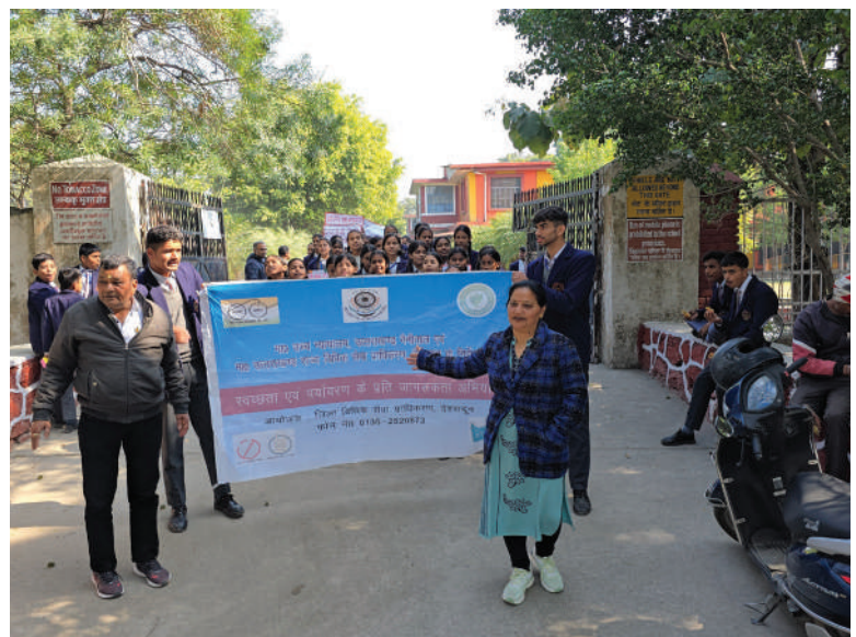
DLSA, Dehradun (Uttarakhand) at Shri Guru Ram Rai Public School, Bindal

January 30, 2025: DLSA, Dehradun (Uttarakhand), organized a legal awareness camp at Shri Guru Ram Rai Public School, Bindal, to educate students on important legal and social issues. The session covered the POCSO Act, Cybercrime, Social Media fraud, the ill effects of drug addiction, and introduced students to the NALSA toll-free legal aid helpline 15100. In addition to the awareness programme, a cleanliness rally was conducted by the students to mark National Cleanliness Day, promoting hygiene and social responsibility. The event witnessed enthusiastic participation and served as a meaningful initiative towards empowering youth through legal knowledge and civic awareness. Resource persons from the legal fraternity and police department engaged with the students, addressing their queries and encouraging proactive legal awareness. The session adopted a student-friendly approach, making complex legal topics more relatable for the young audience.