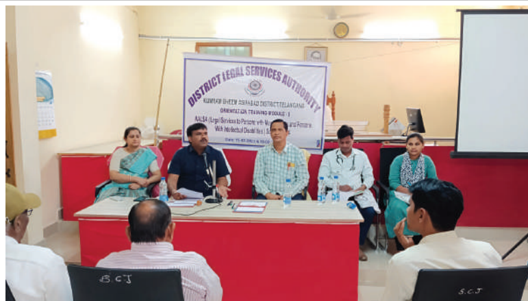
Glimpse from Capacity Building Programme Organized by DLSA, KB Asifabad (Telangana)

February 15 & 16, 2025: DLSA, KB Asifabad (Telangana), conducted an Orientation Training Programme for members of the Legal Services Unit for Persons with Mental Illness and Persons with Intellectual Disabilities under the NALSA (LSUM) Scheme, 2024. The training was held at the Senior Civil Judge Court Hall in Asifabad. The session was designed to provide the members with comprehensive knowledge and practical skills to effectively assist individuals with mental illnesses and intellectual disabilities in navigating and accessing legal services. The programme also focused on engaging participants in understanding the legal challenges faced by these individuals and provided insights into their rights and the legal provisions available for their protection and empowerment.