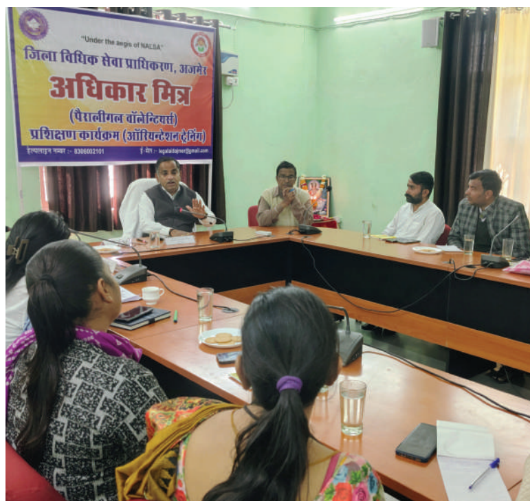
Glimpse from Orientation Training Organized by DLSA, Ajmer (Rajasthan)

March 6, 2025: DLSA, Ajmer (Rajasthan), organized a Training-cum-Sensitization Session titled “PLV Orientation Training.” The session aimed to enhance the knowledge and capacity of Para Legal Volunteers (PLVs) by providing in-depth insights into the Para Legal Volunteer Scheme, its objectives, and implementation framework. The training focused on equipping participants with the necessary legal awareness and practical skills to effectively serve their communities and assist in promoting access to justice. It emphasized the vital role PLVs play in supporting marginalized groups and facilitating legal aid. Through interactive discussions and case studies, the session aimed to prepare PLVs to address common legal issues and provide assistance in legal matters such as domestic violence, women’s rights, and access to government schemes. This initiative contributed to building a stronger, more knowledgeable network of volunteers dedicated to enhancing legal awareness and access to justice within the community. Participants also shared field experiences, allowing for collective learning and exchange of strategies to address grassroots legal challenges. The session reinforced the importance of empathy, vigilance, and accountability in PLVs’ day-to-day roles.