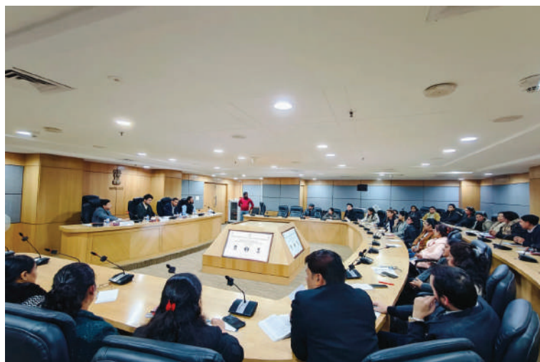
Glimpse from a Training Programme Organized by Delhi SLSA