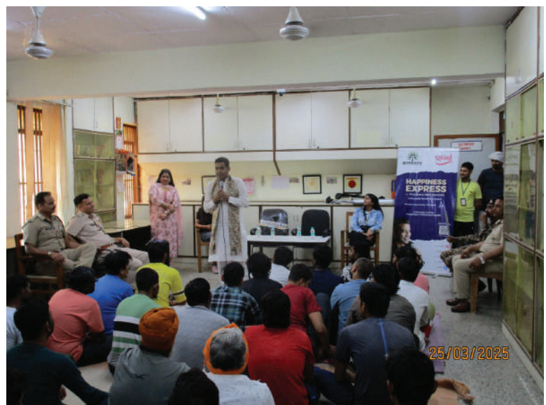
DLSA, North (New Delhi) at Central Jail No. 10, Rohini

March 25, 2025: DLSA, North (New Delhi) organized a mental health awareness session titled "From Isolation to Connection" at Central Jail No. 10, Rohini, for inmates, Para Legal Volunteers (PLVs), legal sewadars, and staff. The session emphasized the importance of mental well-being, offering coping strategies for stress, isolation, and anxiety, along with mindfulness techniques and information on available psychological support within the correctional system. Around 40 inmates actively participated, sharing their experiences in an open and supportive environment. The session aimed to destigmatize mental health issues and promote emotional resilience, ensuring inmates were aware of the mental health resources available to them. The session concluded with one-on-one counseling and guidance for the inmates on accessing ongoing mental health resources, empowering participants to take proactive steps toward improving their mental well-being.