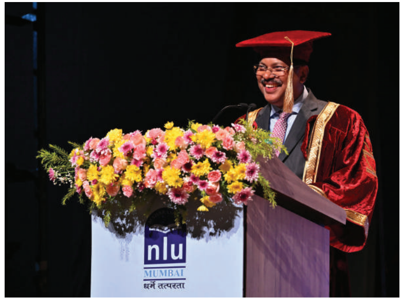
Glimpse from MNLU Convocation: MoU signed for a one-month internship programme with MNLU

With the approval of Hon'ble Mr. Justice B.R. Gavai, Judge, Supreme Court of India and Executive Chairman, NALSA, a significant boost was given to clinical legal education through the approval of proposals submitted by select universities. At MNLU Nagpur, an exclusive one-month internship at Legal Services Institutions was approved as a mandatory component of the B.A. LL.B. (Hons. in Adjudication and Justicing) five-year degree programme. At MNLU Mumbai, a four-week Internship Programme on Legal Research, Drafting, and Practical Exposure to Governance Mechanisms was approved for first and second-year law students, aimed at fostering a deeper understanding of the functioning of legal services authorities and judicial institutions. NLU Delhi has also been granted approval to involve students in various projects under NALSA and legal aid framework, offering them valuable experiential learning opportunities.