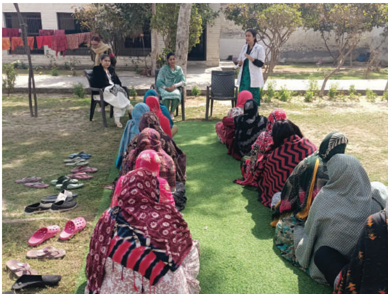
DLSA, Kaithal (Haryana) at District Jail, Kaithal

January 17, 2025: DLSA, Kaithal (Haryana), in collaboration with the Legal Aid Defence Counsel Office, organized five awareness programmes for female inmates of District Jail, Kaithal. The inmates were informed about their rights, including access to free legal aid, bail, parole, furlough, education, and the procedure for applying for legal assistance under the Legal Services Authorities Act, 1987. The sessions were specifically designed to empower the female inmates by providing them with crucial legal knowledge and practical insights, enabling them to better understand and navigate the complexities of the justice system. A total of 24 female inmates benefited from these sessions, gaining a clearer understanding of their rights and available resources. The initiative aimed to create an environment of legal literacy, ensuring that the inmates were aware of the legal support they could access for their rehabilitation, overall well-being and to assert their rights and seek justice.