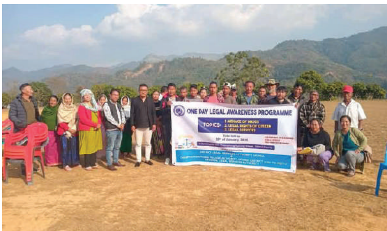
DLSA, Ukhrul (Manipur) at Champhung/Aphung Village

At Community Level : Empowering Communities through Knowledge