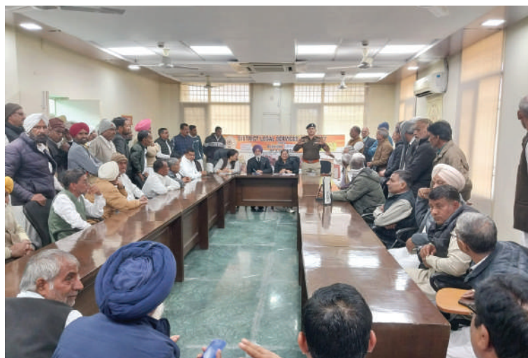
Glimpse from a Capacity Building Programme Organized by DLSA, Sirsa (Haryana)

January 17, 2025: DLSA, Sirsa (Haryana), conducted a meeting with Para-Legal Volunteers (PLVs) to review their work and discuss various NALSA Schemes. During the meeting, PLVs shared the challenges they face while organizing legal aid camps in remote areas in reaching marginalized communities. Panel Advocates, briefed the PLVs on two important NALSA Schemes: the NALSA (Effective Implementation of Poverty Alleviation Schemes) Scheme, 2015, which helps people access government poverty alleviation programmes, and the NALSA (Legal Services to Workers in the Unorganized Sector) Scheme, 2015, which focuses on providing legal support to workers in the unorganized sector. The session aimed to equip PLVs with the knowledge and tools to effectively implement these schemes in their respective areas. The meeting concluded with a renewed commitment to strengthen grassroots legal outreach.